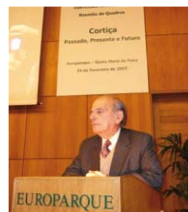
Professor José Hermano Saraiva