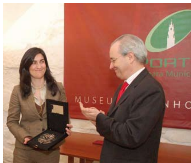
“Best of Wine Tourism 2007” Award

These awards are recognition, after one and a half years of business operations, of the work invested in the project and added responsibility a propos of excellence in the field of wine tourism.