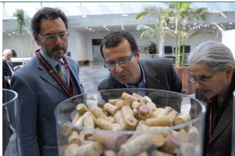
Members of the "Concours Mondial de Bruxelles" international jury examine the cork stoppers removed during the competition.