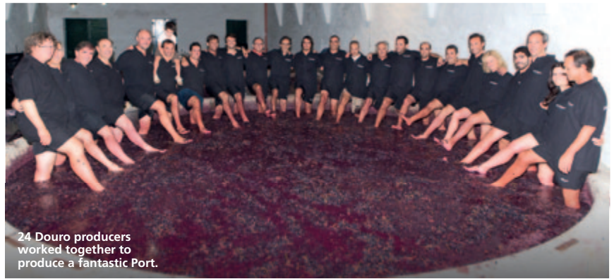
24 Douro producers worked together to produce a fantastic Port.

Autumn's arrival is a good reason to visit the Douro and enjoy the region's natural beauty and landscape, which after the grape harvest season takes on a special charm, inviting tourists to spend more time here. Quinta Nova offers a variety of sightseeing tours, ranging from visits to the region, wine tasting in front of a warm fire and gastronomic moments, among others. For more information please contact hotelquintanova@amorim.com .