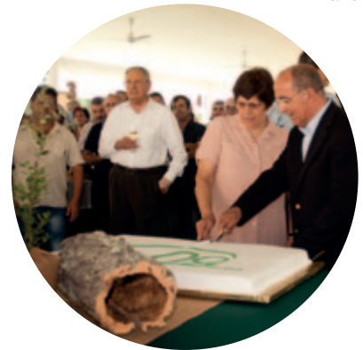
Long-standing employees cut the celebratory cake

António Rios de Amorim, Chairman of Corticeira Amorim, highlighted in his speech that “a path of 50 years, is the result of vision, ambition and above all, hard work and dedication. Today, the challenges we face are just as current as 50 years ago. The same determination to overcome them is needed. Our ambition is to create new products and applications where cork is the differentiating element and, as a result, conquer new markets.”